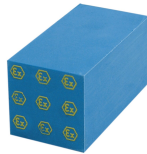
RM Ex solid compensation module